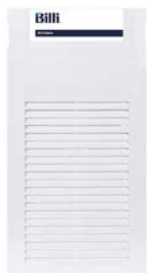
Alpine under-counter unit