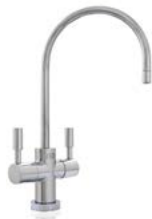
Sparkling 200 Dual-lever Dispenser*