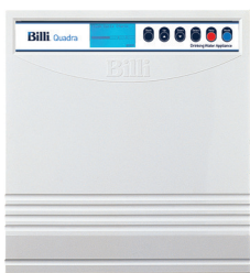
Quadra under-counter unit