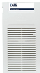
Quadra Sparkling under-counter units